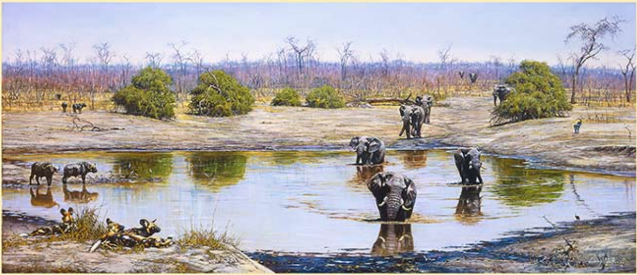
Danga Pan (Hwange National Park), Limited Edition of 700, Signed and Numbered. Exhibition Price ZAR4750 (approx. $450)

Prints (Fine Art reproductions on Canvas) 10% of proceeds to Hwange Conservation Society