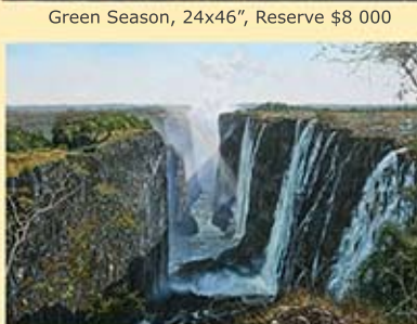
Eastern Cataract, 24x36", Reserve $5 000