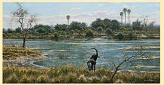
Sable Bull Near Chinde Island, 24x46", Reserve $6 000