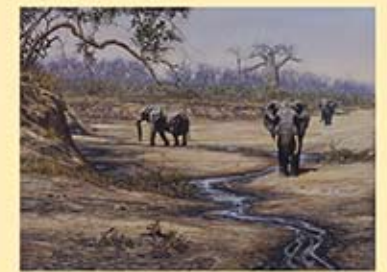
Burning Sands, 18x24", Reserve $3 000