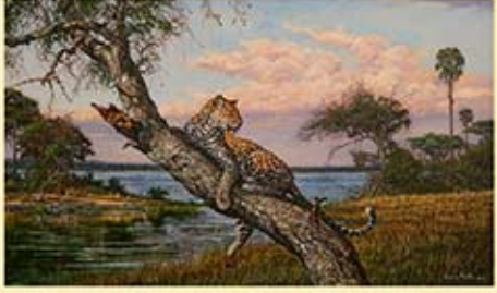
Zambezi View, 24x40", Reserve $15 000