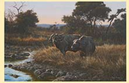
Matetsi Buffalo, 18X36", Reserve $4 000

Bids are invited for any of the works illustrated here. Larger, more detailed images and sizes available on request.