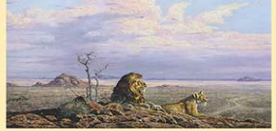
Ohorongo Lions, 24x40", Reserve $5 000

st For paintings commissioned as a result of this appeal, 10% will be donated to the Society st