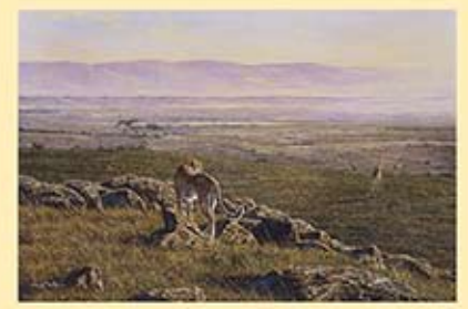
Rift Valley, 20x30", Reserve $5 000