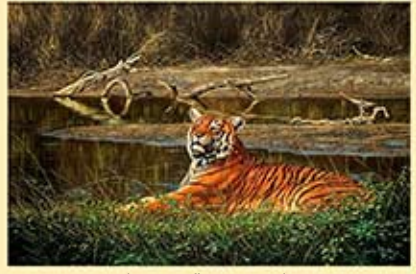
Legend, 24x36", Reserve $10 000