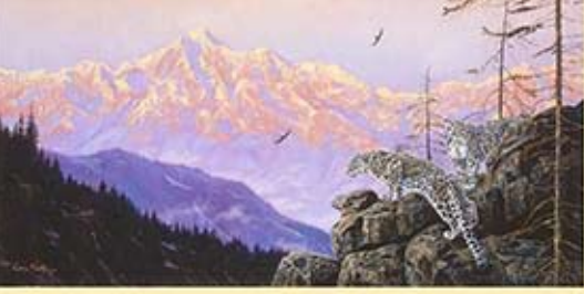
Himalaya, 24x40", Reserve $5 000