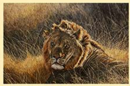
Lion Study, 18x28", Reserve $3 000