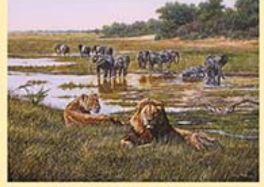
Linyanti, 30x40", Reserve $6 000